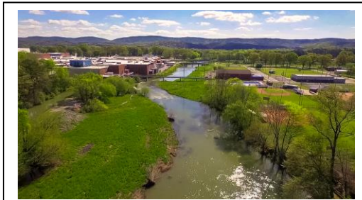
Mount Vernon Mills on the banks of the Chattooga River in Trion, Georgia. Photo from upstream at the Chattooga Dam.

Being located directly on the banks of a scenic river in Trion, Georgia, it would make sense that Mount Vernon would prioritize and effectively manage storm water runoff from its largest manufacturing operation. We do.