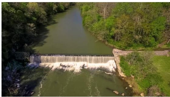
The Dam on the Chattooga River, built in 1875 when the mill was rebuilt after a fire destroyed it. The original mill, completed in 1847, was shut down in 1864 when General Sherman's Union Army came through, but Sherman did not burn it. The 1875 building (Mill No. 1) is still in use today.