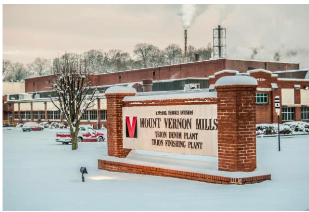
Mount Vernon's Apparel Fabrics Group flagship operations located in the northwest Georgia community of Trion.