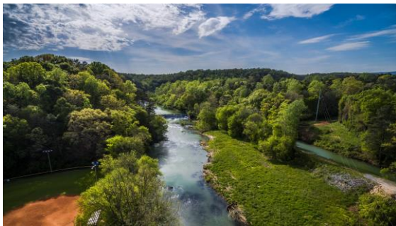
Chattooga Dam as viewed from Mount Vernon's operations. Notice the race to the right in the picture where water was diverted around the dam originally for hydroelectric power generation at the mill in the late 19 th and early 20 th Century. Today, river water is permitted for use as non-contact cooling water for chillers and air washers.