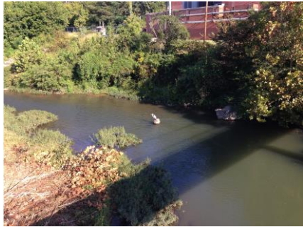
A blue heron with the "50 yard line" fishing spot on a rock in the Chattooga River in Trion, Georgia adjacent to Mount Vernon's facility. These guys know where the best fishing is because it's not just their hobby.

Extensive efforts were made in the 1990's to eliminate from our process chemistry any regulated chemicals requiring reporting to EPA under Section 313 of the Emergency Planning and Community Right-To-Know Act (EPCRA), as well as any chemical considered a Hazardous Air Pollutant (HAP) under the 1990 Clean Air Act Amendments. Working with our vendors at the time, we were able to eliminate nearly all of these regulated chemicals from our manufacturing. Today, Mount Vernon is not considered a major source of HAP by EPA at any of its locations. We have also minimized our Volatile Organic Compound (VOC) emissions by carefully screening our chemicals and to the greatest extent possible using only those that are based on the most state of the art technology to be